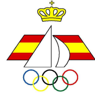
Royal Spanish Sailing Federation